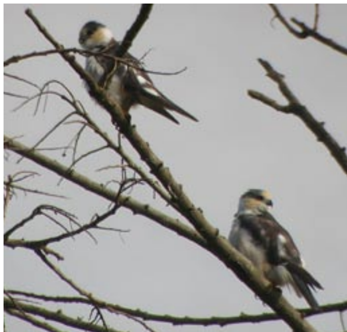
Two immature Pearl Kites at the Satipo ricefields