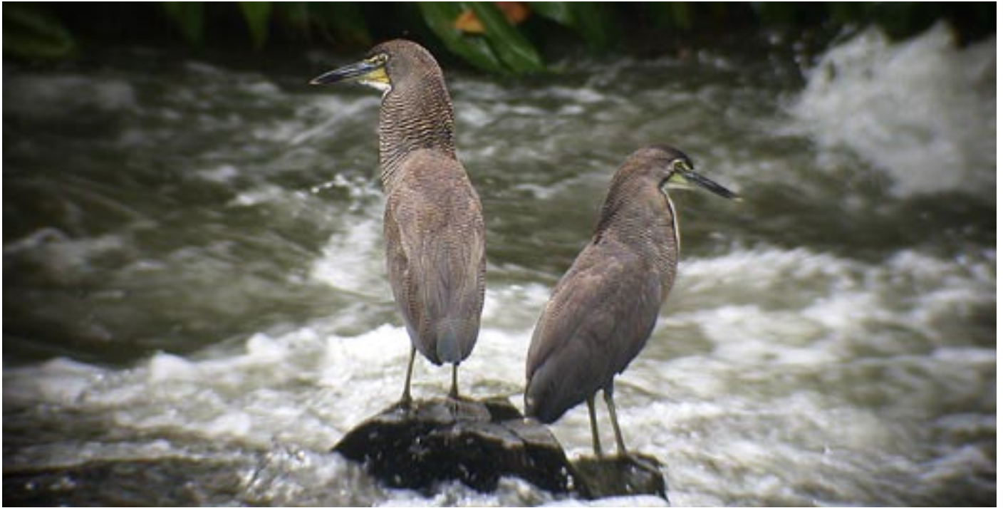
Fasciated Tiger-Herons in the river near Tingo Maria. We were lucky with this species on this trip with several sightings