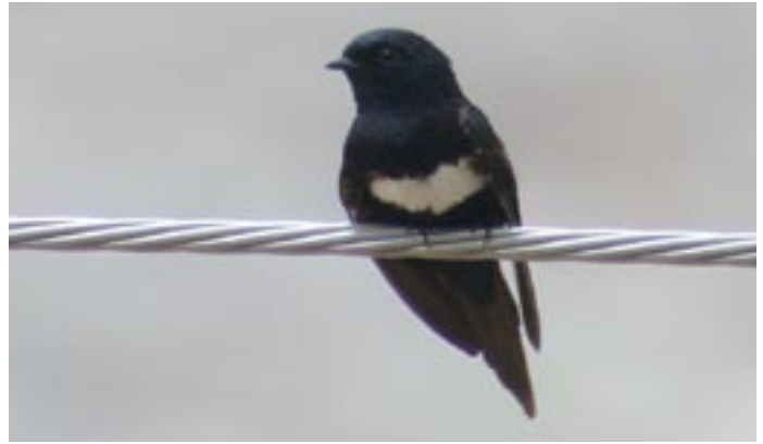
White-banded Swallow is always seen near rivers

3+3 seen on the Paty trail, 3 seen between Oxapampa and Villa Rica