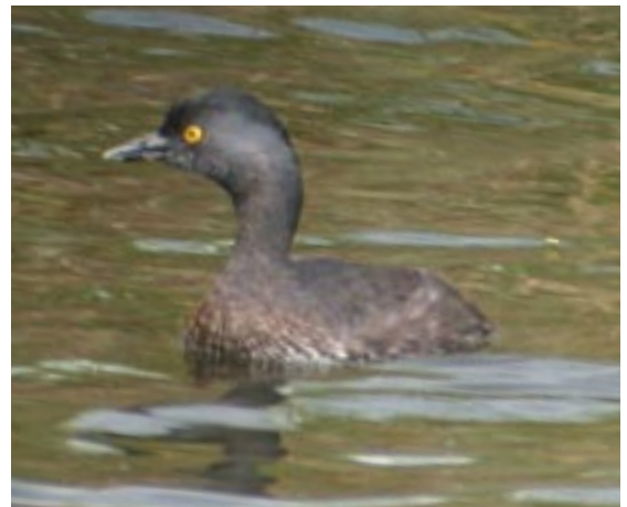
Least Grebe, common at laguna Oconal in the outskirts of Villa Rica

2 seen between Huanuco and La Quinoa, 3-4 seen on Satipo road