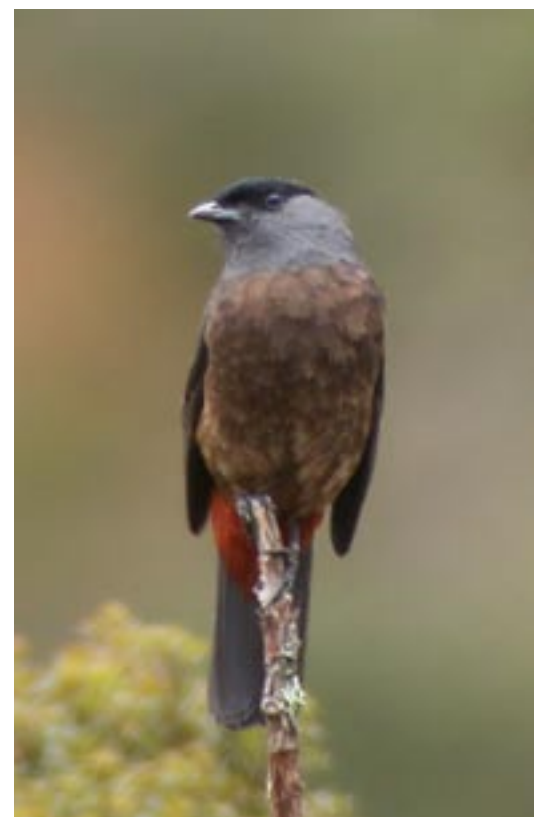
Adult Bay-vented Cotinga at Bosque Unchog