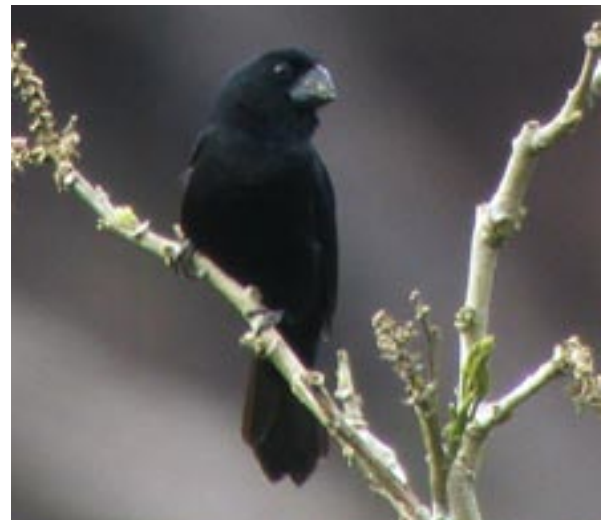
Male Black-billed Seed-Finch at the Satipo rice-fields. Always a rare sight.