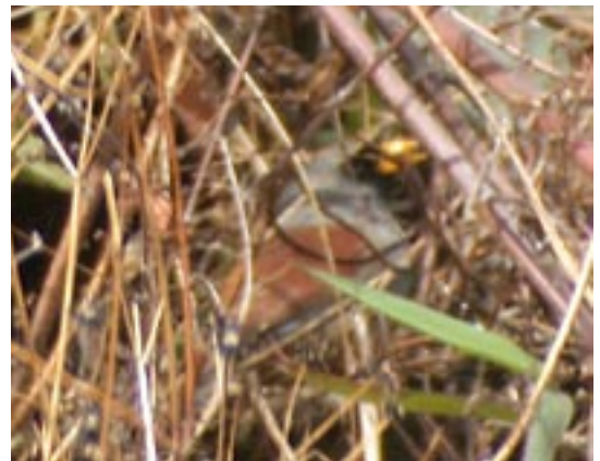
A record-shot of the Rufous-backed Inca-Finch

1 seen at the Oilbird cave, 1 seen at Villa Jennifer, 10 seen at the Satipo ricefields