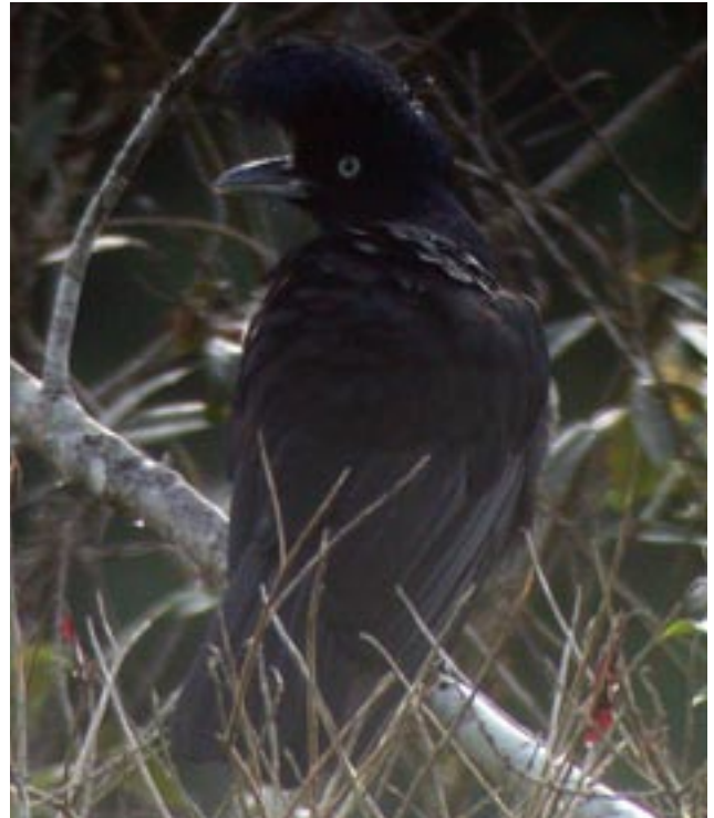
Male Umbrellabird near Mariposa on the Satipo road. Eight seen in total on the trip.

1 seen at the Carpish tunnel, 3 seen on the Satipo road