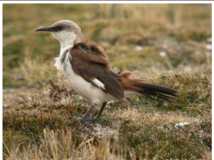
White-bellied Cinclodes one of the rarest species of the world !

Among the hundreds of ducks, grebes, herons, coots and gulls, we even observe an adult of Red-gartered Coot... a vagrant bird in Peru (first mention) coming from the south of South America !!