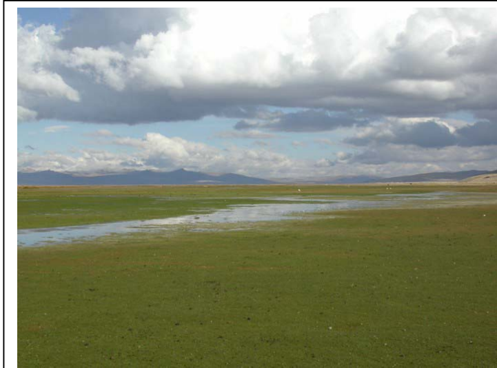
Bank of the Junin lake

The Junin lake is an immense lake of more than 150 km 2 located at more than 4000m of altitude. Its shores is home for tens of thousands of water birds, and among them an apterous and endemic species of the lake, the Junin Grebe. The total population of this species unfortunately strongly dropped because of the pollution caused by the mining companies, and it is estimated that it currently remains around 300 ind. in all.... this species is