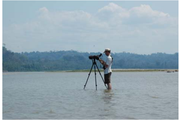
Digiscoping in Amazonia.

But Andean countries, and particularly Peru, kept my predilection. I already spent more than one year in Peru, if I add up all the trips I carried out in this country. Nevertheless, lots remain to be discovered!