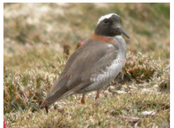
The Diademed Sandpiper-plover, a sought-after species of the High Andes.