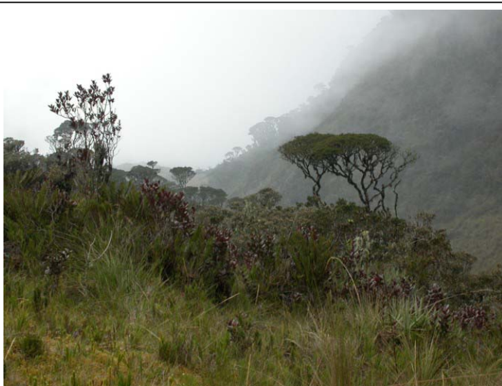
Bosque Unchog, one of the rare places in the world where it's possible to see the Golden-backed Mountain-tanager, a target endemic species of the trip.