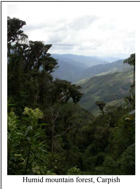
Humid mountain forest, Carpish

The rest of the day we birded our way down the valley in easy pace to Lima to the search for the birds that we did not find while going up. During this first day, we already observed 7 endemic species!